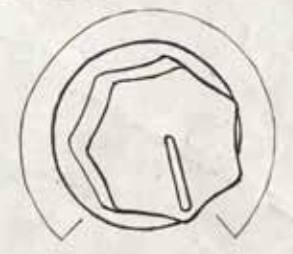
LASER RADIAL/ LASER